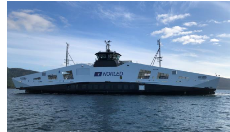
Ship of the year - MF Hydra