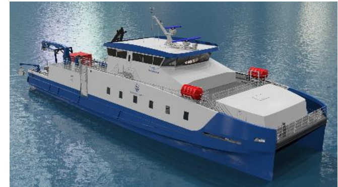
Illustration of new vessel for Directorate of Fisheries